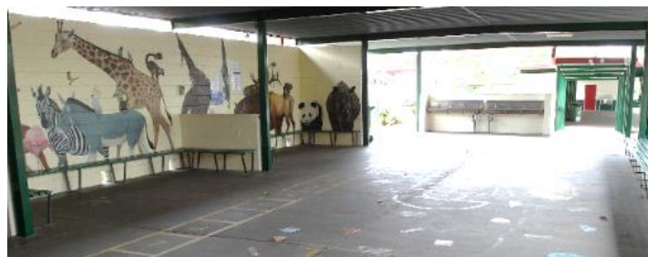
'Animal Mural' Covered Area for Years 1-2 and 3

Year 3 students assemble seated in allocated class lines (no handball, no games) beneath the large 'animal mural' covered area. A Teachers Aide monitors this area from 8am so parents may promptly depart the school. Class teachers attend to collect their classes by 8.45am.