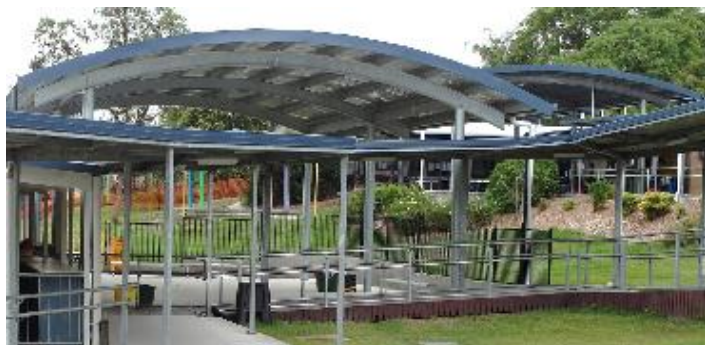
The two Preparatory Covered Areas

Preparatory Year students assemble under either large covered area and await teacher collection.