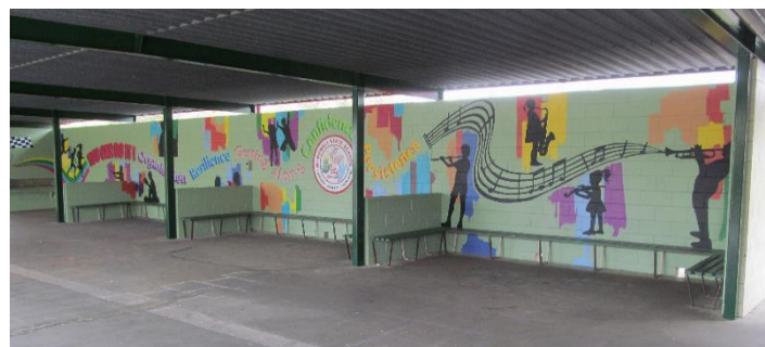
'School Emblem' Covered Area for Years 4 to 6.